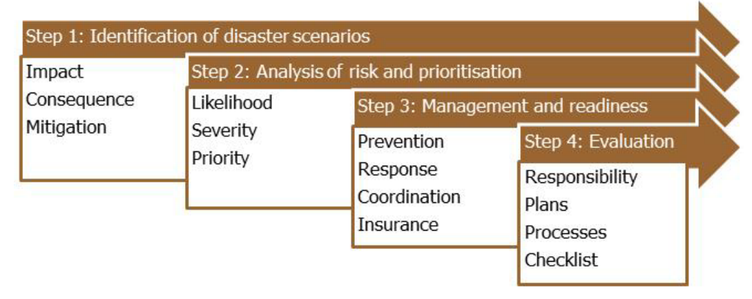
Figure 1 Process of developing the Disaster Recovery Plan