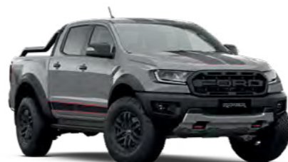
Conquer Grey 3