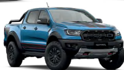
Ford Performance Blue 3