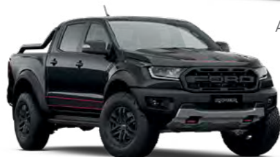
Shadow Black 3