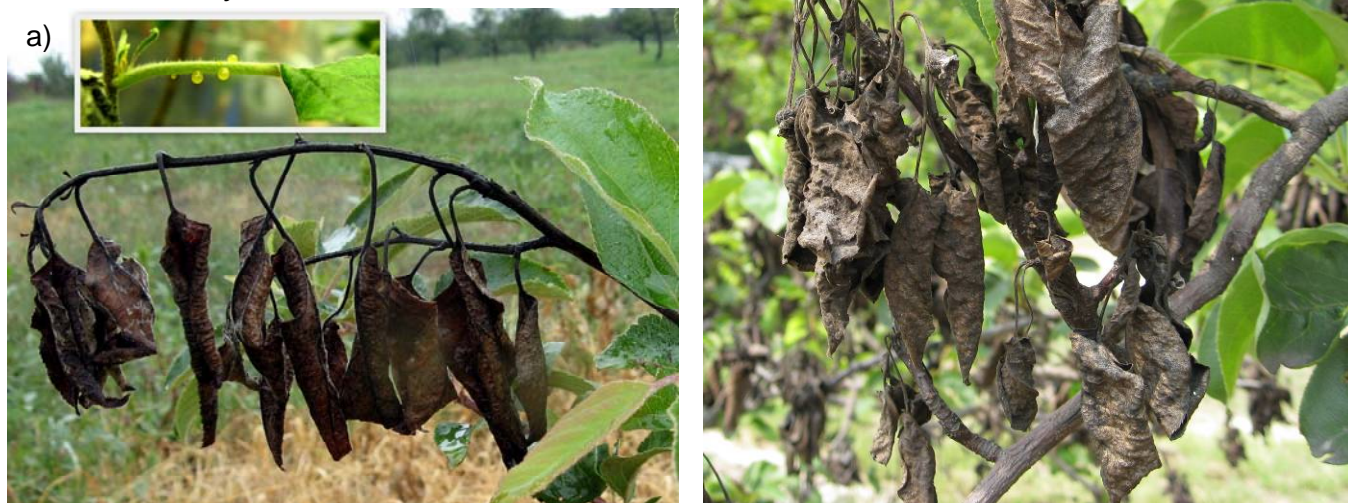
Fig. 1. Symptoms of fireblight stem dieback a) including bacterial ooze from petioles (Brendon Rodoni, DPI Victoria, b) early symptoms on Waterer's cotoneaster (R. Grimm, bugwood.org) and c) apple (Christine Horlock - QDAFF).

Australia has strict quarantine laws on the entry of plant material that could introduce Erwinia amylovora . However, in 1997 the