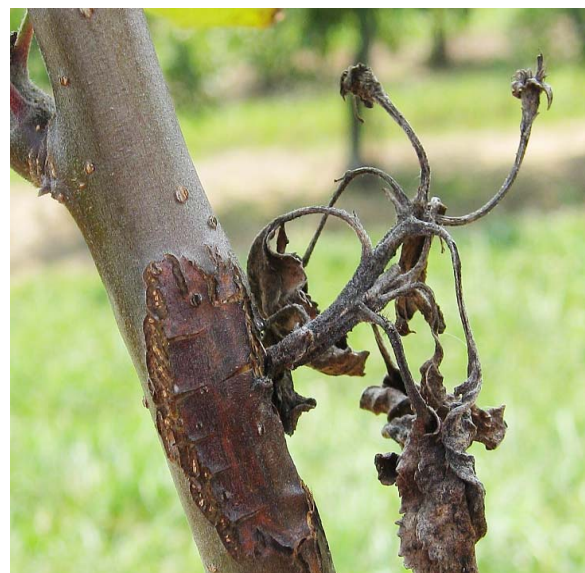
Fig. 3. Fire blight infection has caused the death of flowers, stems and leaves, and a large and may cause brown cankers.