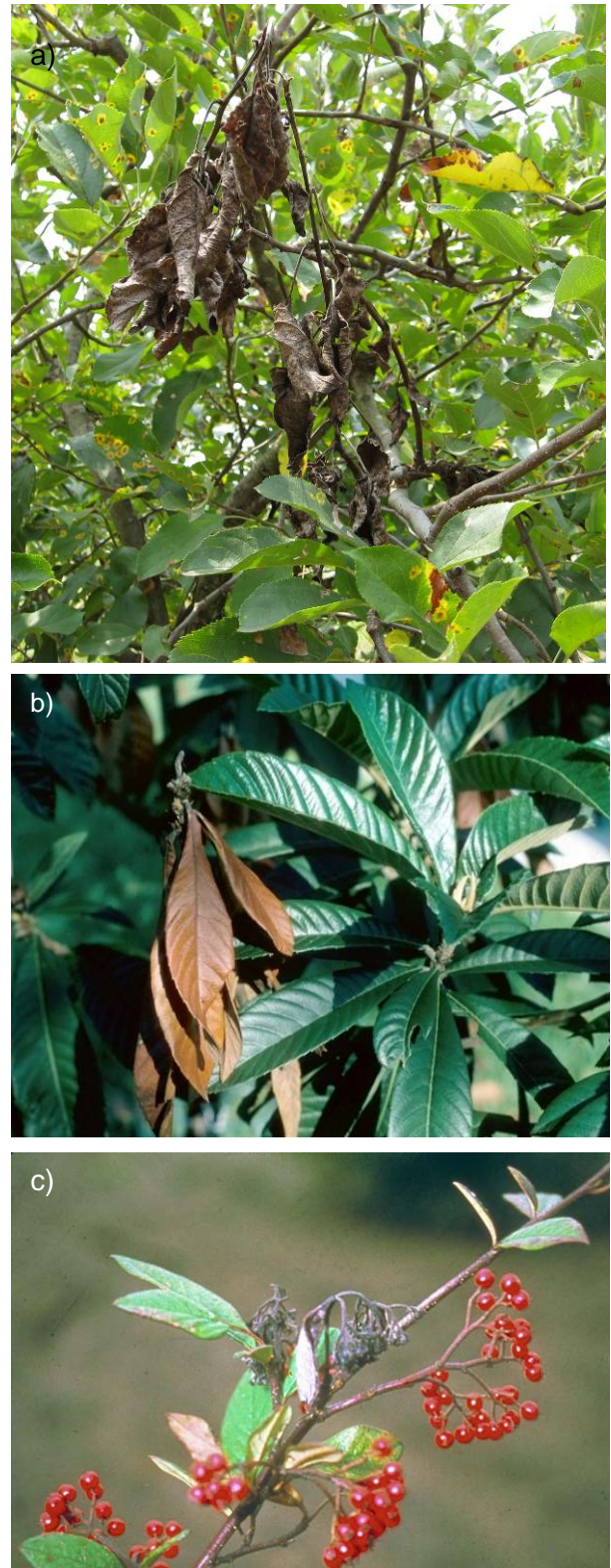
Fig. 2. Tip dieback and brown wilting of leaves of a) apple, b) loquat and c) cotoneaster.

Cankers occurring on lower branches may extend to the stem base, killing the plant. During wet, humid conditions cankers exude a sticky ooze filled with bacteria. An amber coloured bacterial ooze is often evident on infected fruit such as apple (Horlock and Persley, 2009).