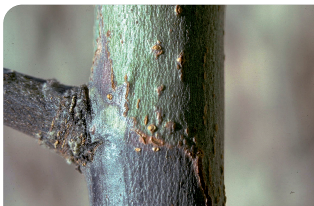
Dark sunken cankers appear on branches