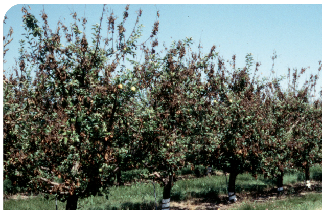
Infected trees have a rusty, burnt appearance

Other symptoms include water soaked and dark sunken cankers, dry twigs, dead branches that appear a burnt or deep rust colour, and dead leaves that remain on the tree. Blossoms and fruitlets may also develop a dark brown to black blight.