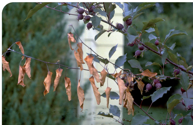
Branches appear burned and then die