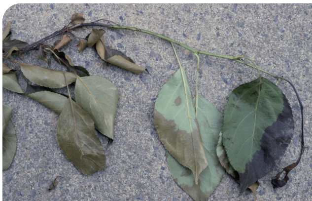
Young leaves appear glassy and water soaked before turning black