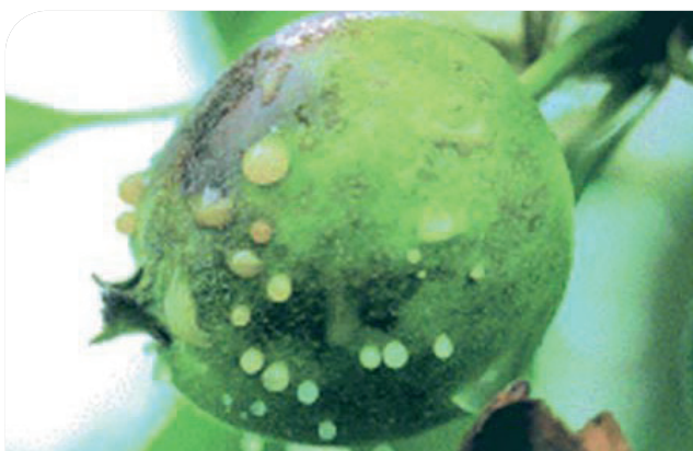
Translucent liquid containing bacteria oozes from infected fruit