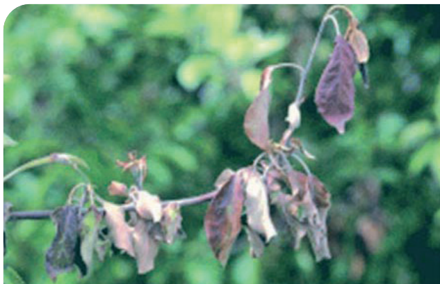
Typical 'shepherd's crook' bending of shoots