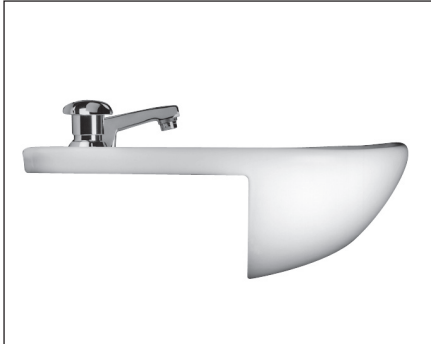
Tapware shown not included.