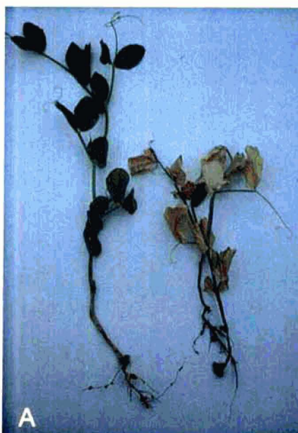
Fig. 3. Fusarium wilt ( F. oxysporum f. sp. psis ) of pea: (A) Wilted plants on right, healthy plant on left; (B) root symptoms.

Dinitroaniline herbicides disrupt the flagella of zoospores (16) and thus reduce the severity of root rots caused by phycomycetous fungi such as Pythium , Aphanomyces , and Plasmodiophora (1). Because most fields in Ontario have a high density of Fusarium spp. and a low density of Pythium spp. (5,17), the