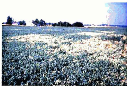
Fig. 1. Patches of root rot in a field of green peas.

Disease cycle. The four main root rot fungi in Ontario have similar disease cycles. F. oxysporum and F. solani produce conidia and septate mycelia during the infectious stage and chlamydo-spores during the resting stage. Pythium spp. and A. euteiches produce zoospores and aseptate mycelia during the infectious stage and oospores during the resting stage. P. ultimum , however, does not produce zoospores. Both chlamydo-spores and oospores can survive in soil for many years. Fungal populations increase rapidly in soils on which peas and other susceptible legumes have been grown but