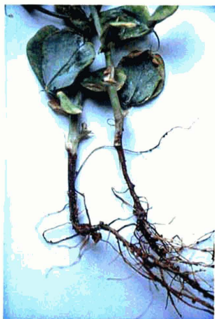
Fig. 2. Fusarium root rot ( F. solani f. sp. psis ) of pea.

decrease gradually over time in the absence of susceptible hosts. Fusarium spp. may also survive on the roots of nonhost crops. Pythium and Aphanomyces spp. have a wide host range and may survive pathogenically or saprophytically by colonizing other crops and weeds (10). Any of the main root rot fungi can be disseminated by movement of contaminated soil, diseased plant debris, and contaminated or infected seed.