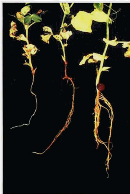
Fig. 5. Aphanomyces root rot ( A. euteiches ) of pea.