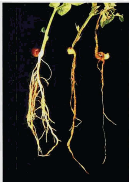
Fig. 4. Pythium root rot ( Pythium spp., most often P. ultimum ) of pea; healthy plant on left.

Cultivar selection. Most cultivars used in Ontario are highly susceptible to both Fusarium wilt and root rot. To determine if any cultivars are resistant to the Ontario root rot complex, several obtained from various research organizations and seed companies were evaluated for specific resistance to Fusarium wilt and nonspecific resistance to Fusarium , Pythium , and Aphanomyces root rots. Some pathotypes of F. solani , P. ultimum , and A. euteiches have been