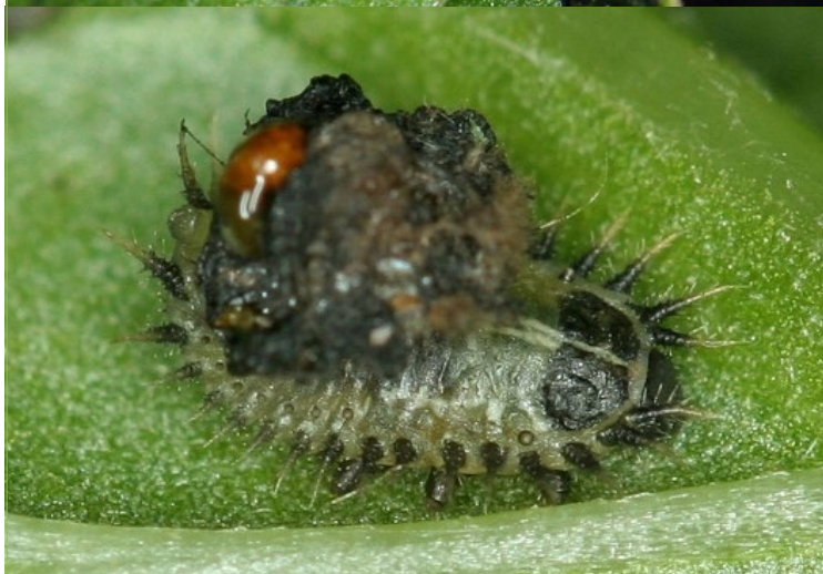
Tortoise beetle adult (above) and larva with excreta carried on its back (below).