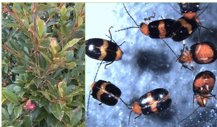
Leaf beetle damage of Syzygium by Monolepta sp. (left), probably M. rubrofasciata (right).

Given the diversity of lifecycles within this group of beetles it is often helpful to identify the species. This may assist in gathering information on when it is likely to be active, the number of generations per year and where each life stage occurs (i.e. where eggs are laid, pupation occurs, etc.). This information can help to break the lifecycle of the pest in a nursery setting.