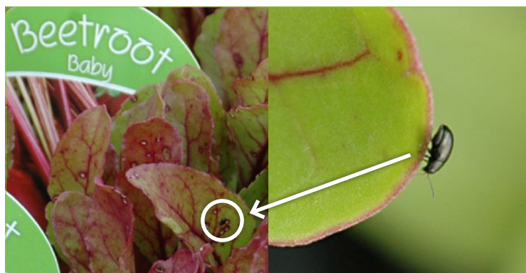
Flea beetle damage on baby beetroot (left) and close up of flea beetle (right).