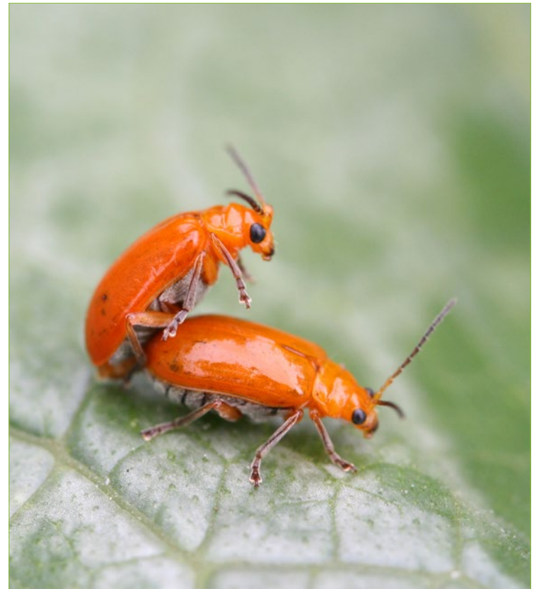
Mating pumpkin beetles on zucchini

Adult leaf beetles are small to medium sized insects (4–15mm) with varied body shapes across the groups. The most common leaf beetles are circular to oval in shape with a strongly domed back. Other species have bodies that are relatively long and narrow; some species that jump have strongly developed hind legs. They can be brightly coloured with stripes or patterns of red, yellow, orange or green; adults can also be shades of white, grey or black and some species may be iridescent. Antennae are usually less than half the body length and are most often cylindrical, being the